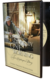
Suddenly One Morning: The Shopkeeper's Story (radio theater production) by Charles R. Swindoll and Insight for Living Ministries single CD radio drama