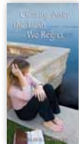
Clearing Away the Trash We Regret by Charles R. Swindoll booklet