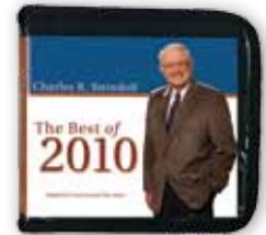
The Best of 2010 by Charles R. Swindoll CD series