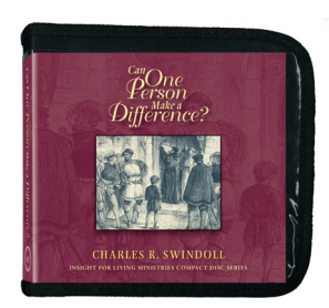
Can One Person Make a Difference? by Charles R. Swindoll compact disc series