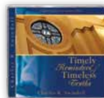
Timely Reminders of Timeless Truths by Charles R. Swindoll CD

To order any of these related resources, call 0800-915-9364 or visit www.insightforliving.org.uk