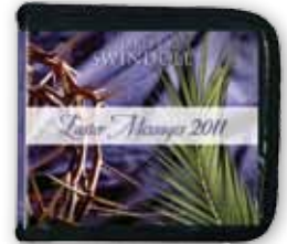
Easter Messages 2011 by Charles R. Swindoll CD series