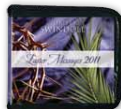
Easter Messages 2011 by Charles R. Swindoll CD series