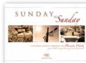
Sunday to Sunday: A Pictorial Journey Through the Passion Week by Charles R. Swindoll and Insight for Living softcover book