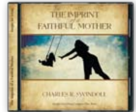
The Imprint of a Faithful Mother by Charles R. Swindoll