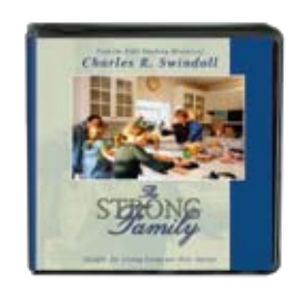
The Strong Family by Charles R. Swindoll CD series

To order any of these related resources, call 0800-915-9364 or visit www.insightforliving.org.uk