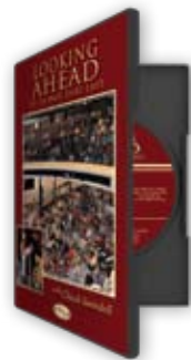
Looking Ahead to Things That Last by Charles R. Swindoll