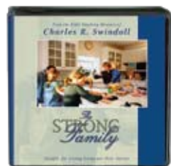
The Strong Family by Charles R. Swindoll