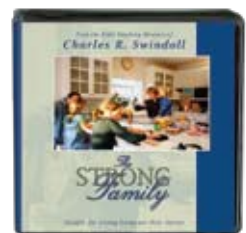
The Strong Family by Charles R. Swindoll