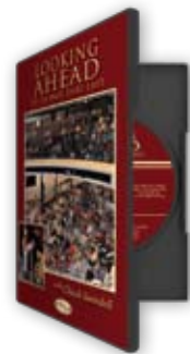
Looking Ahead to Things That Last by Charles R. Swindoll