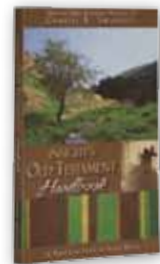
Insight's Old Testament Handbook: A Practical Look at Each Book by Insight for Living paperback book

To order any of these related resources, call 0800-787-9364 or visit www.insightforliving.org.uk