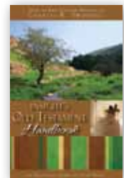
Insight's Old Testament Handbook: A Practical Look at Each Book by Insight for Living softcover book

To order any of these related resources, call 0800-915-9364 or visit www.insightforliving.org.uk