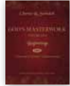
God's Masterwork Volume One Beginnings—A Survey of Genesis–Deuteronomy by Charles R. Swindoll CD Series