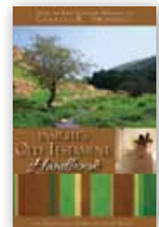
Insight's Old Testament Handbook: A Practical Look at Each Book by Insight for Living softcover book

To order any of these related resources, call 0800-915-9364 or visit www.insightforliving.org.uk