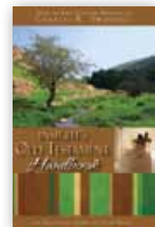
Insight's Old Testament Handbook: A Practical Look at Each Book by Insight for Living paperback book

To order any of these related resources, call 0800-915-9364 or visit www.insightforliving.org.uk