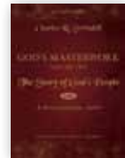
God's Masterwork Volume Two The Story of God's People—A Survey of Joshua–Esther by Charles R. Swindoll CD series