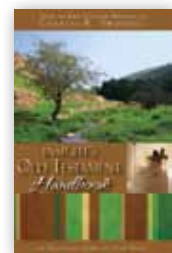
Insight's Old Testament Handbook: A Practical Look at Each Book by Insight for Living paperback book

To order any of these related resources, call 0800-915-9364 or visit www.insightforliving.org.uk