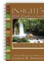
Insight's Bible Reading Guide: Old Testament by Insight for Living spiral-bound book

To order any of these related resources, call 0800-787-9364 or visit www.insightforliving.org.uk