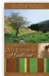
Insight's Old Testament Handbook: A Practical Look at Each Book by Insight for Living paperback book