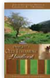
Insight's Old Testament Handbook: A Practical Look at Each Book by Insight for Living paperback book