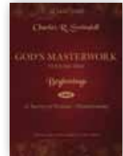
God's Masterwork Volume One Beginnings—A Survey of Genesis–Deuteronomy by Charles R. Swindoll CD series