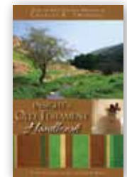
Insight's Old Testament Handbook: A Practical Look at Each Book by Insight for Living paperback book