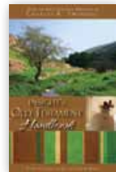
Insight's Old Testament Handbook: A Practical Look at Each Book by Insight for Living paperback book