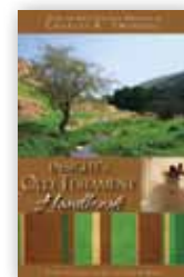
Insight's Old Testament Handbook: A Practical Look at Each Book by Insight for Living paperback book