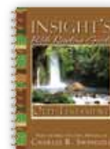
Insight's Bible Reading Guide: Old Testament by Insight for Living spiral-bound book

To order any of these related resources, call 0800-787-9364 or visit www.insightforliving.org.uk