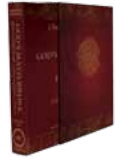
God's Masterwork, Volume Six: Letters to God's People—A Survey of Romans–Philemon by Charles R. Swindoll Classic CD series of 13 CDs