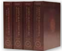
God's Masterwork, Volumes One–Four (A Survey of the Old Testament) by Charles R. Swindoll Classic CD series of 40 CDs