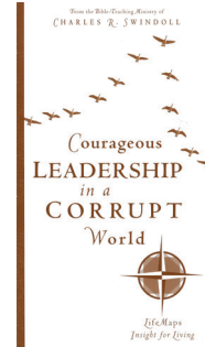
Courageous Leadership in a Corrupt World by Insight for Living Ministries softcover book

For these and related resources, visit www.insightworld.org/store or call USA 1-800-772-8888 • AUSTRALIA +61 3 9762 6613 • CANADA 1-800-663-7639 • UK +44 1306 640156