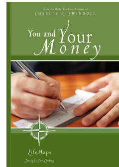
You and Your Money by Insight for Living Ministries softcover book

For these and related resources, visit www.insightworld.org/store or call USA 1-800-772-8888 • AUSTRALIA +61 3 9762 6613 • CANADA 1-800-663-7639 • UK +44 1306 640156