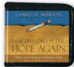
Insights on 1 Peter Hope Again: When Life Hurts and Dreams Fade by Charles R. Swindoll CD Series