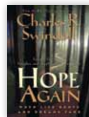
Hope Again: When Life Hurts and Dreams Fade by Insight for Living workbook