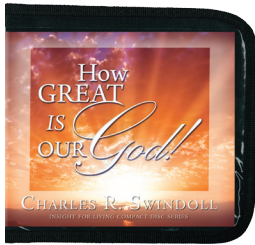
How Great Is Our God! by Charles R. Swindoll CD series