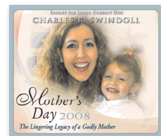
Mother's Day Message by Charles R. Swindoll compact disc