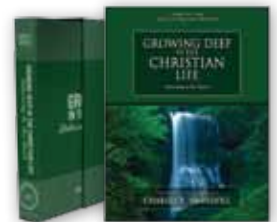
Growing Deep in the Christian Life by Charles R. Swindoll CD series with workbook