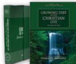
Growing Deep in the Christian Life by Charles R. Swindoll CD series with workbook