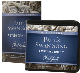
Paul's Swan Song by Charles R. Swindoll and Insight for Living Ministries CD series and softcover Bible Companion