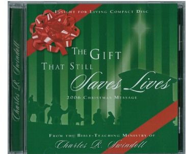
A Christmas Message 2006: The Gift That Still Saves Lives by Charles R. Swindoll compact disc

For related resources, please call USA 1-800-772-8888 • AUSTRALIA +61 3 9762 6613 • CANADA 1-800-663-7639 • UK +44 1306 640156