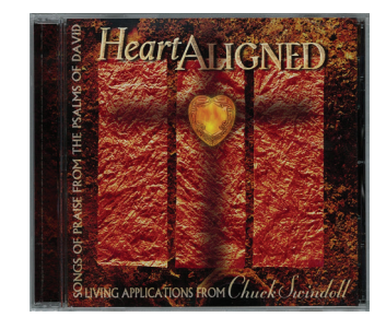
Heart Aligned: Songs of Praise from the Psalms of David with Living Applications from Chuck Swindoll music CD