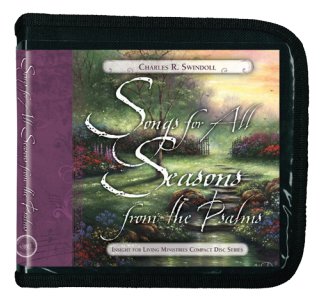
Songs for All Seasons from the Psalms by Charles R. Swindoll and Insight for Living Ministries CD series