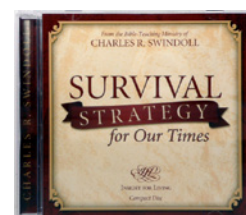
Survival Strategy for Our Times by Charles R. Swindoll CD

To order any of these related resources, call 0800-915-9364 or visit www.insightforliving.org.uk