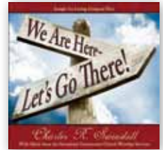
We Are Here— Let's Go There! by Charles R. Swindoll compact disc