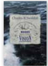
Moses: A Model of Pioneer Vision by Charles R. Swindoll softcover book