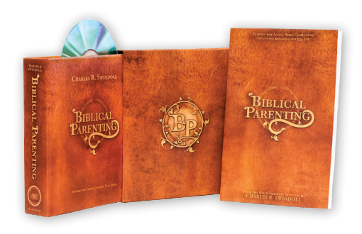
Biblical Parenting by Charles R. Swindoll and Insight for Living Ministries Classic CD series and softcover Bible Companion