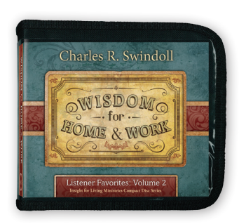
Listener Favorites Volume 2: Wisdom for Home and Work by Charles R. Swindoll compact disc set